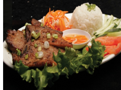
104 CƠM GÀ NƯỚNG