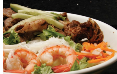
70 BÚN ĐẶC BIỆT