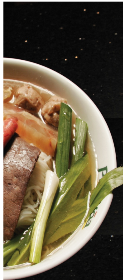
46 PHỞ ĐẶC BIỆT

*There is a risk eating raw or uncooked food.