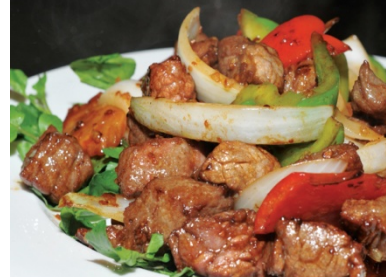
205 GÀ XÀO CÀ RI