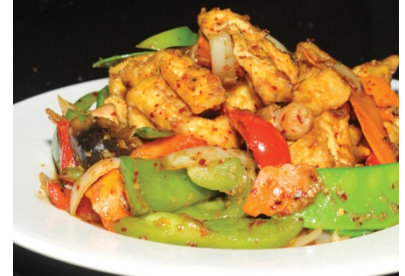
181 PHỞ ÁP CHẢO XÀO GÀ