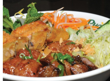
90 BÁNH HỎI ĐẶC BIỆT